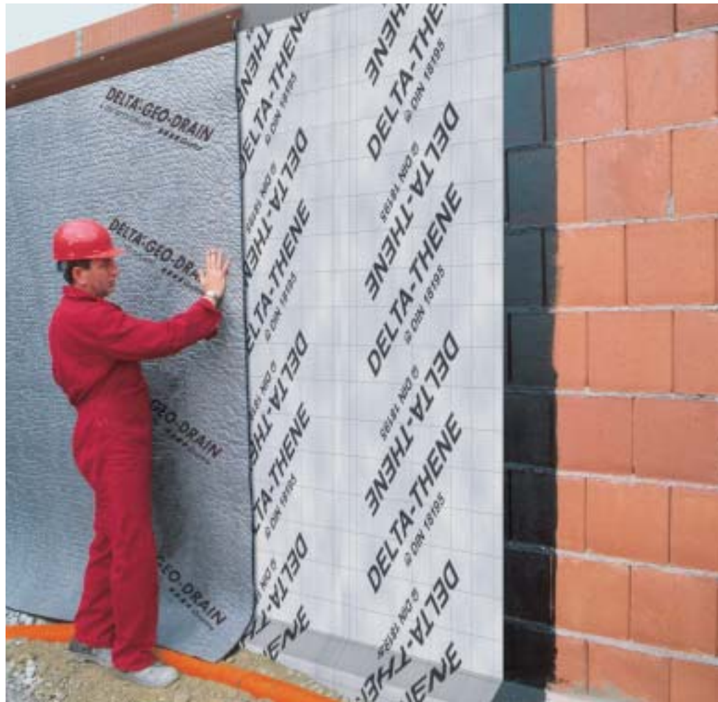
DELTA®-GEO-DRAIN Quattro and DELTA®-THENE are designed for swift installation.