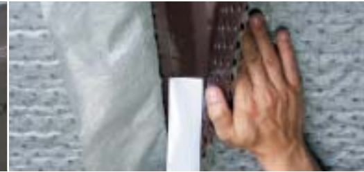
"Wallpapered" straight off the roll.